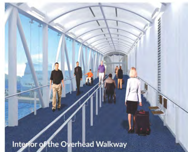
Interior of the Overhead Walkway