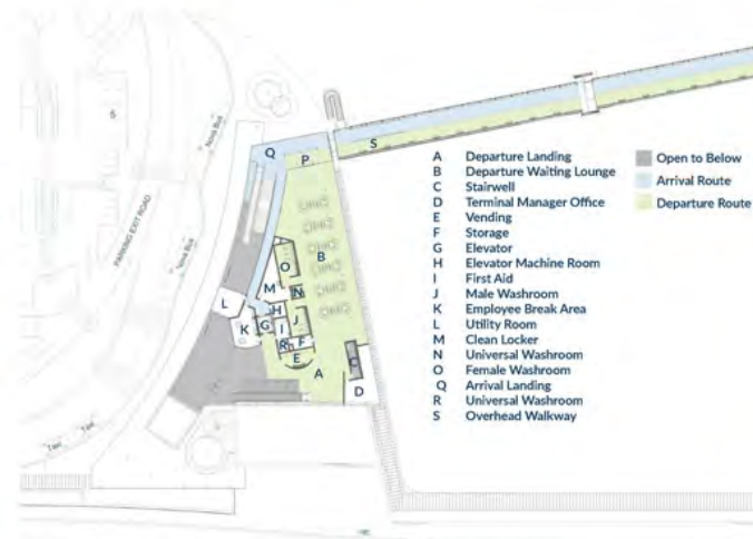
CONCEPT SECOND FLOOR LEVEL