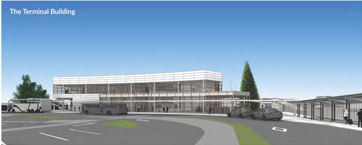
The Terminal Building