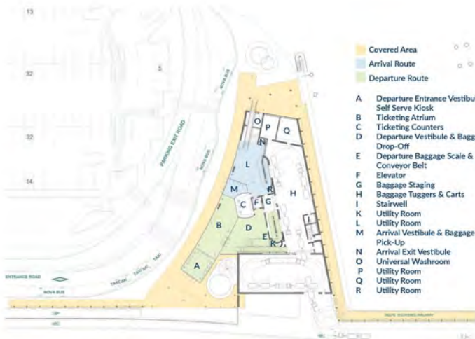
MAIN FLOOR CONCEPT PLAN