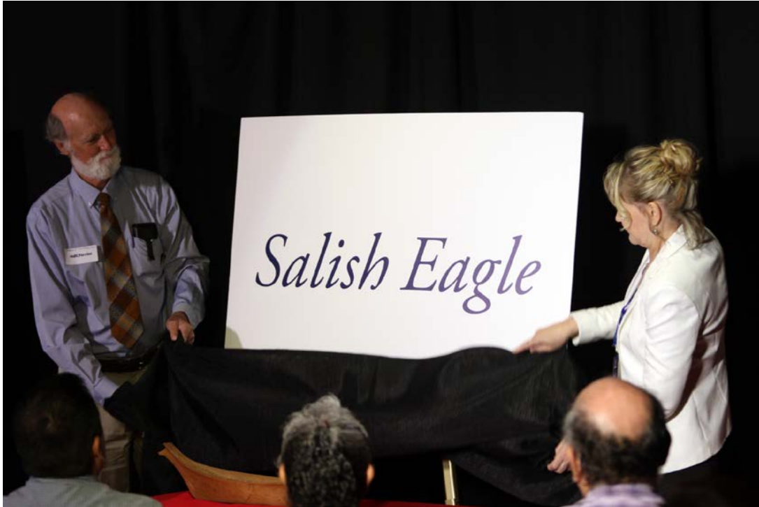
The second ferry name unveiled, the Salish Eagle, will sail in the Southern Gulf Islands.