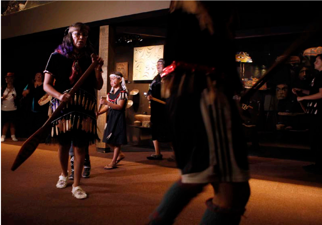
Songhees Paddle Dancers at the vessel naming ceremony.