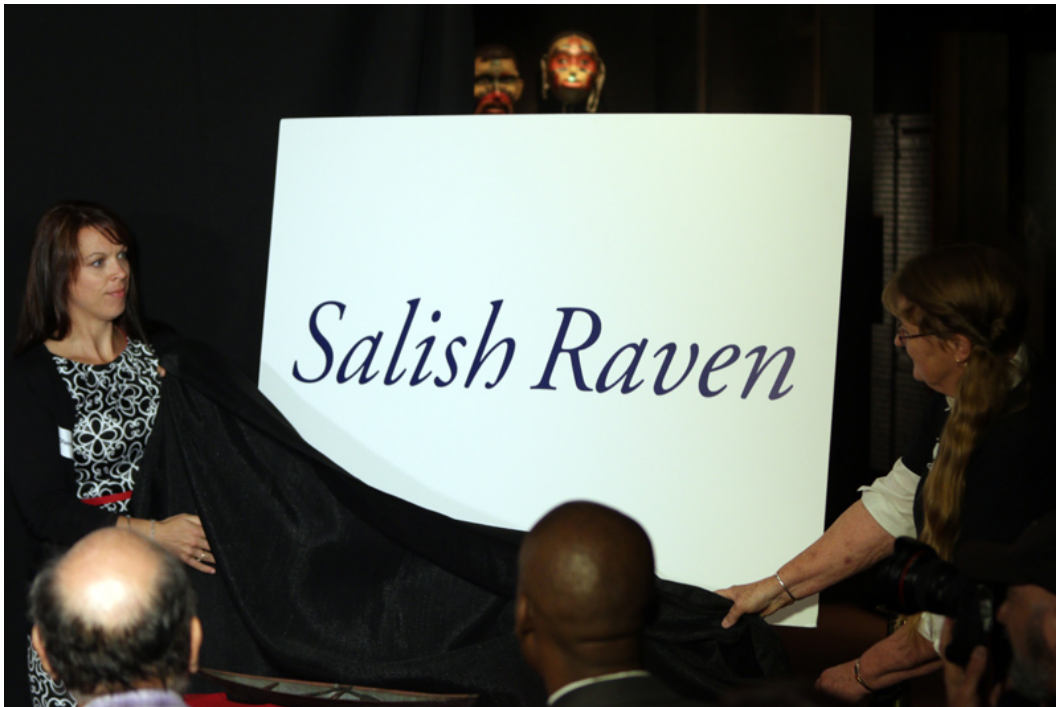
The third ferry name unveiled, the Salish Raven, will sail in the Southern Gulf Islands.