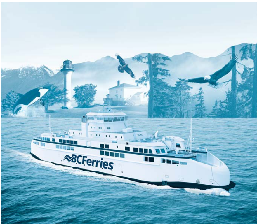
Artist rendering of Salish-Class Vessels