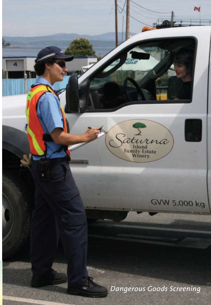
Dangerous Goods Screening