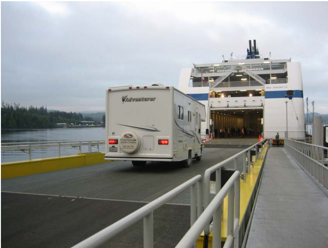
First passenger vehicle boards inaugural sailing of the Northern Expedition