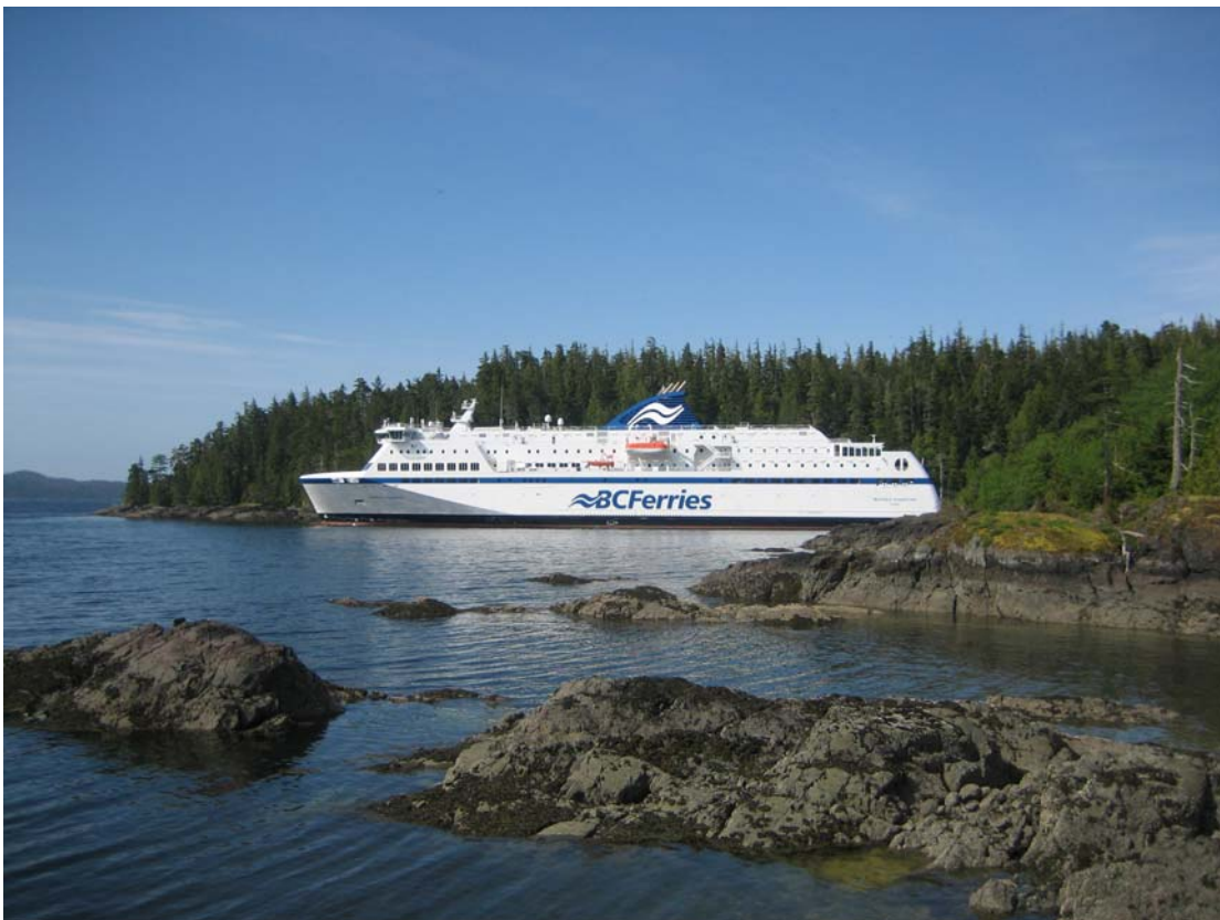
The Northern Expedition at Bear Cove Terminal, Port Hardy